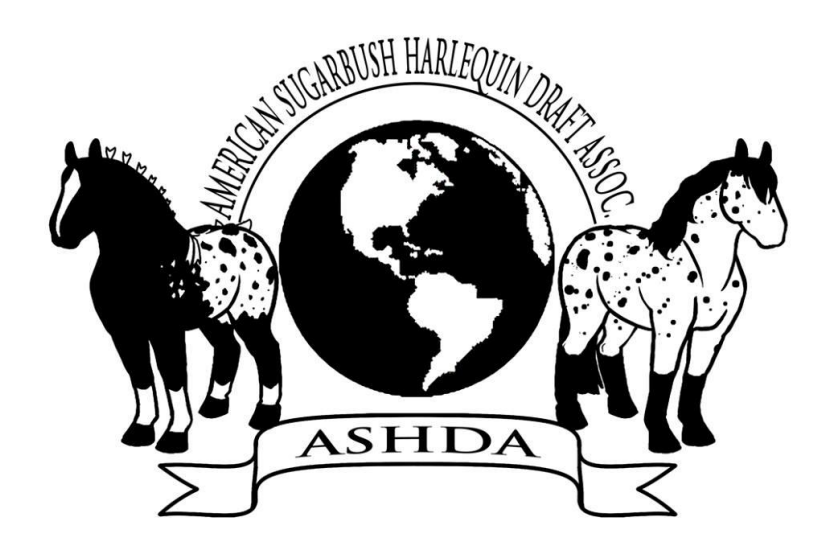
ASHDA Official Logo