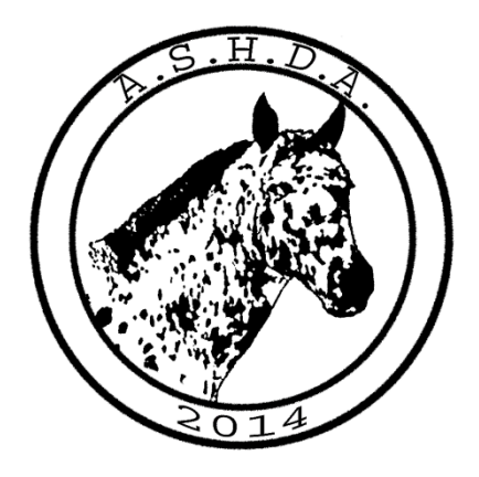
ASHDA Official Seal

The ASHDA Seal shall have inscribed thereon the name of ASHDA and the year of organization. The Seal may be used by causing it or a facsimile thereof to be impressed or affixed or in any manner to be reproduced. No individual or unauthorized entity may use the official ASHDA seal or Logo without written permission from the Executive Director. This excludes official ASHDA merchandise sold through the Association.