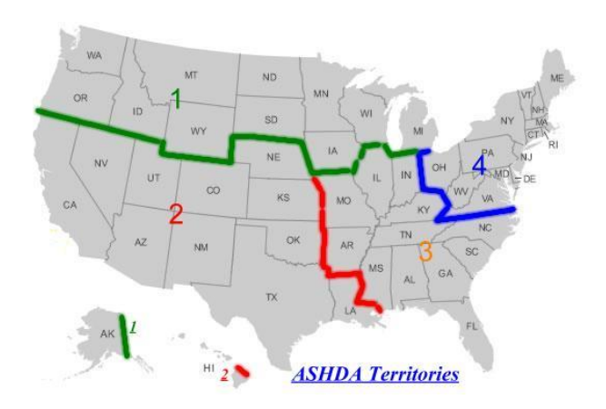
Territory 1. Alaska, Idaho, Iowa, Michigan, Minnesota, Montana, North Dakota, Oregon, South Dakota, Washington, Wisconson, Canada

Territory 2. Arizona, California, Colorado, Hawaii, Kansas, Louisiana, Nebraska, Nevada, New Mexico, Oklahoma, Texas, Utah, Australia, New Zealand, China, Japan, India